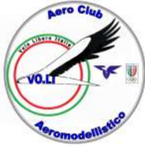
Aero Club VO.LI Aeromodellistico Via Legnano, 3 – 10128 Torino, Italy